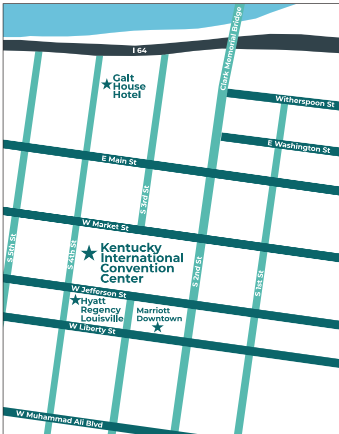
EXHIBIT WITH HSPA

HSPA 2025 is taking place in Louisville, Kentucky, and all educational sessions, social events and exhibits have been secured at Kentucky International Convention Center.